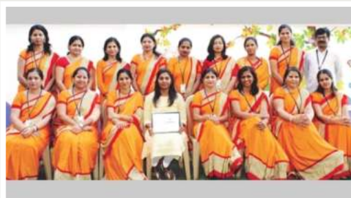
Promising Pre-Schools of Future By : Education World