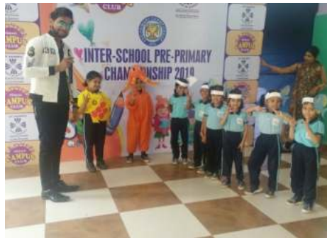
Students of LKG won in the Lokmat Campus Club & St.Xavier's Interschool Preprimary Championship 2019.