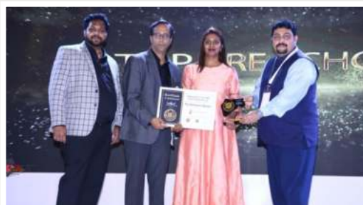
Maharashtra Top CBSE Schools By : Education Today