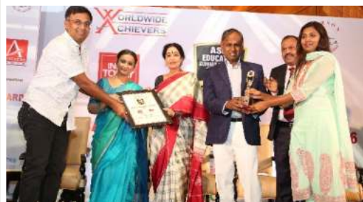
Emerging & Innovative School in Maharashtra By : Worldwide Achievers - Asia Education Summit