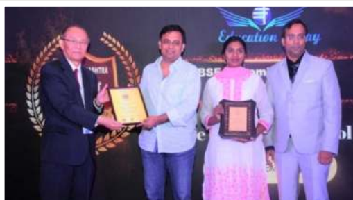
CBSE Upcoming School By : Education Today