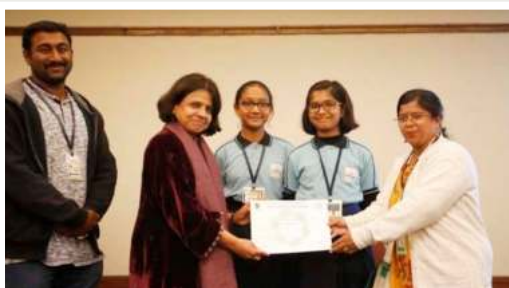
Green School Program Award By : Center for Science & Environment