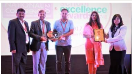
Top 100 Pre-Schools in India By : Brainfeed Magazine