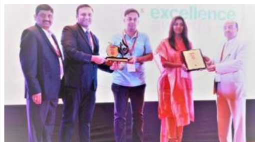
Excellence in STEM Education By : Brainfeed Magazine