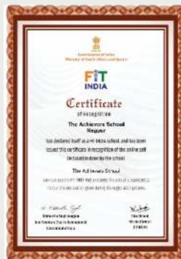
Fit India School By : Ministry of Youth Affairs and Sports Government of India