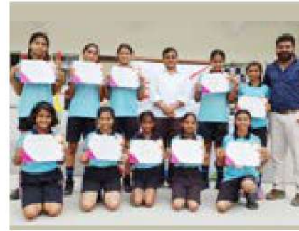
Basket Ball-Inter-School Winner