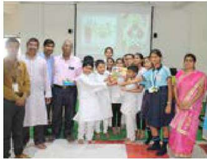
Singing-Abhang Gayan Spardha Winner

Being known for rendering quality education for over a decade, the school also has an impressive list of awards to its credit.