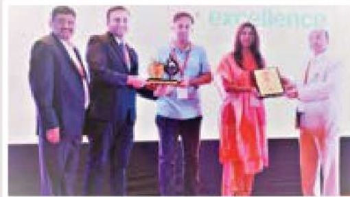
Excellence in STEM Education By : Brainfeed Magazine