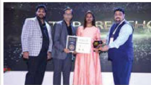
Maharashtra Top CBSE Schools By : Education Today