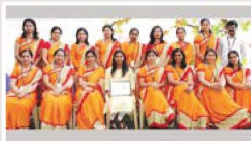
Promising Pre-Schools of Future By : Education World