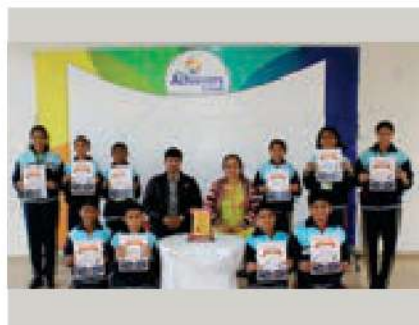
Dance-Akhil Natrajam Antar Sanskrutik Sangha Nagpur