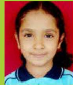
Navya Sarode Inter School State Level Skating Competition