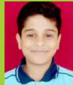
Punit Dambale Inter School Divisional Level Skating Competition