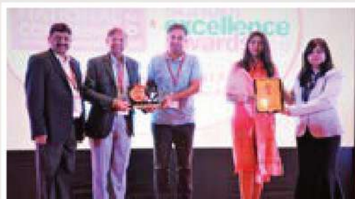
Top 100 Pre-Schools in India By : Brainfeed Magazine