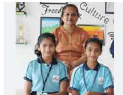
Inter School Table Tennis Divisional Level Comprtition, Bhandara