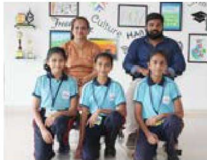
Table Tennis-DSP Winner