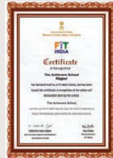
Fit India School By : Ministry of Youth Affairs and Sports Government of India