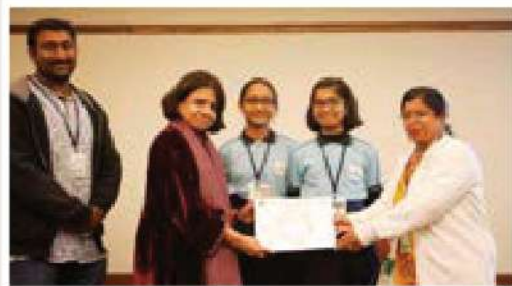
Green School Program Award By : Center for Science & Environment