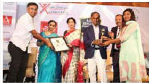
Emerging & Innovative School in Maharashtra By : Worldwide Achievers - Asia Education Summit