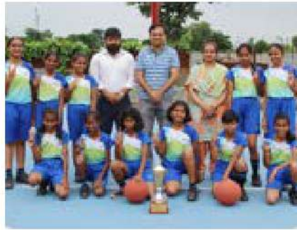
Basket Ball-Division Winner