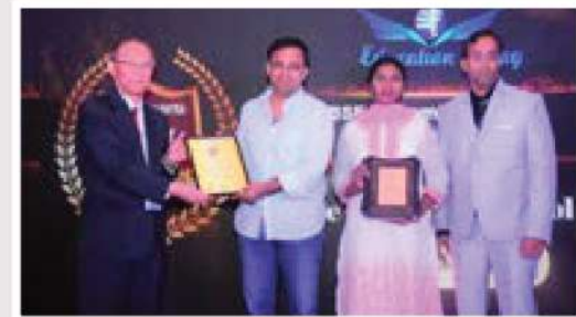
CBSE Upcoming School By : Education Today